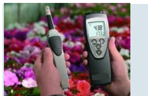
smart testo 625 with radio handle and radio module