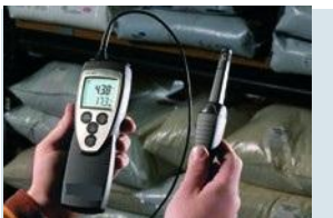
Moisture probe head via handle with probe wire