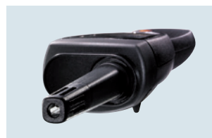
smart testo 625 with attached probe head