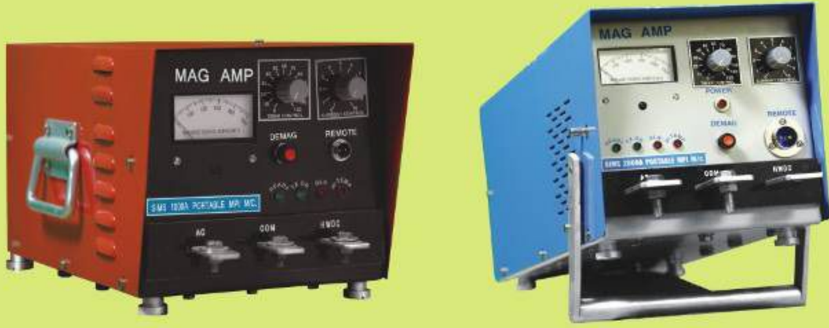
Portable MPI Machines