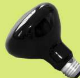
UV Bulb 50W