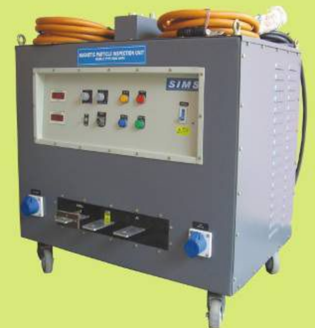
Mobile MPI Unit