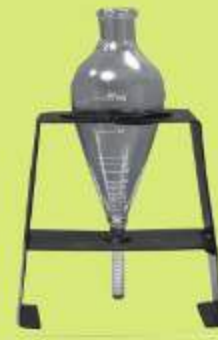
Centrifuge & Stand