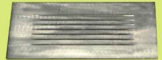
BHEL Test Block