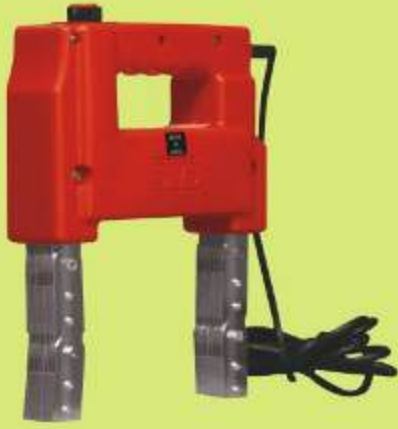
Electro Mag Yoke