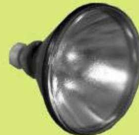
UV Spot Bulb 100W