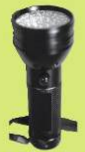
UV LED Torch