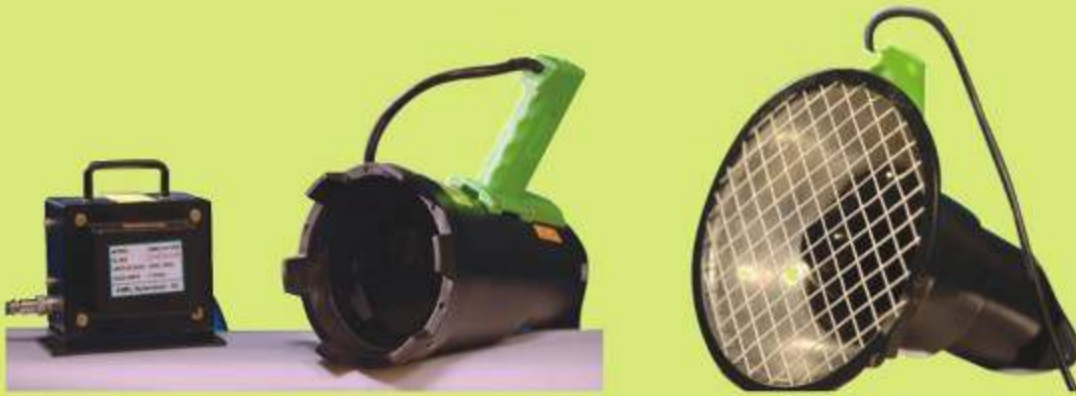
Ultra Violet Lights