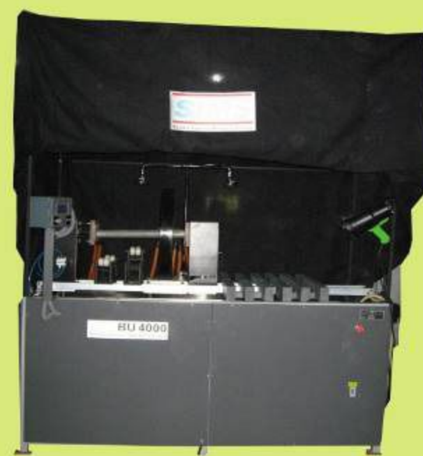
Bench Type MPI Unit