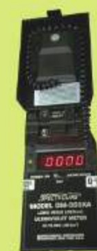
UV Intensity Meter