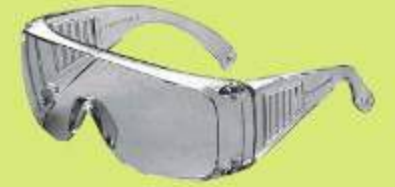
UV Protection Goggles