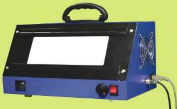
Radiographic Film Viewers-LED