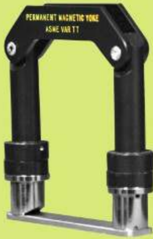
Permanent Magnetic Yokes