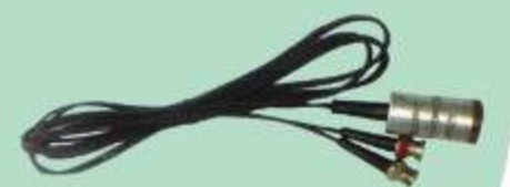
Probes & Cables