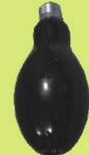
UV Bulb 125W