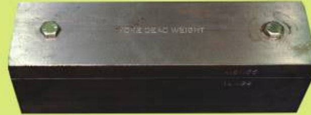
Yoke - Dead Weight